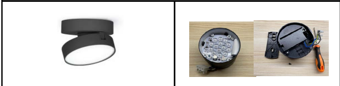
1. Light 2. Pry open the diffuser and fixed board