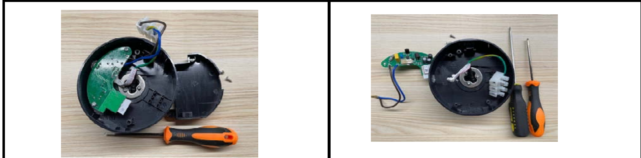
3. Unscrew and remove the other fixed board 4. Unscrew and remove the control board