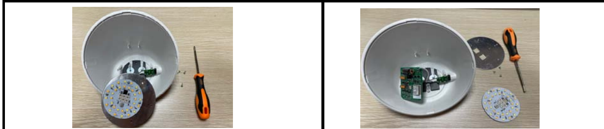
3. Remove the screws on fixed board 4. Unscrew and remove the fixed board and LED board