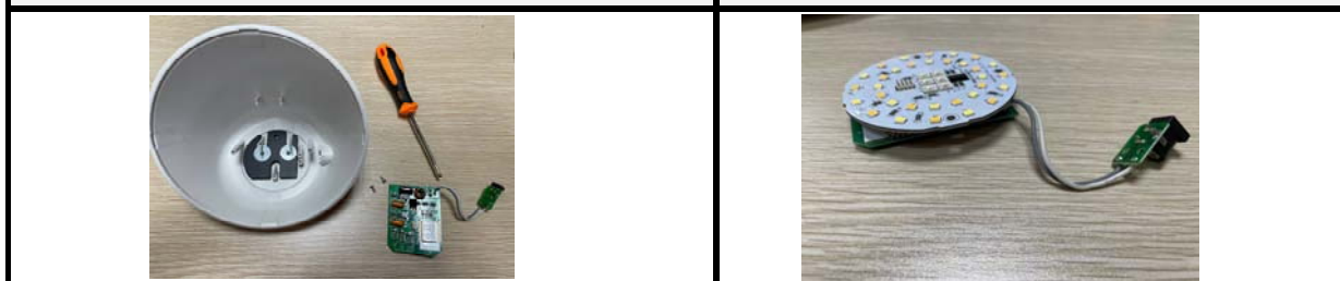
5. Unscrew and remove the control board 6. Module