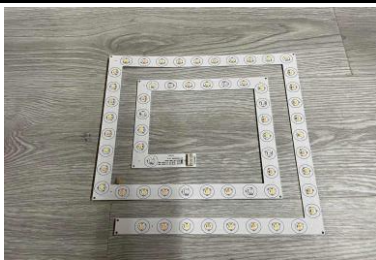
7. Remove the other part of LED board