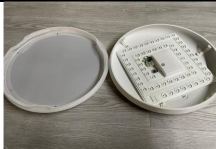
2. Rotate and remove the cover