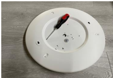
3. Remove the fixing screw on the back