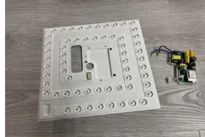
6. Unplug the connection line and remove the control board