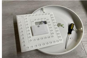
4. Unscrew and remove the module and